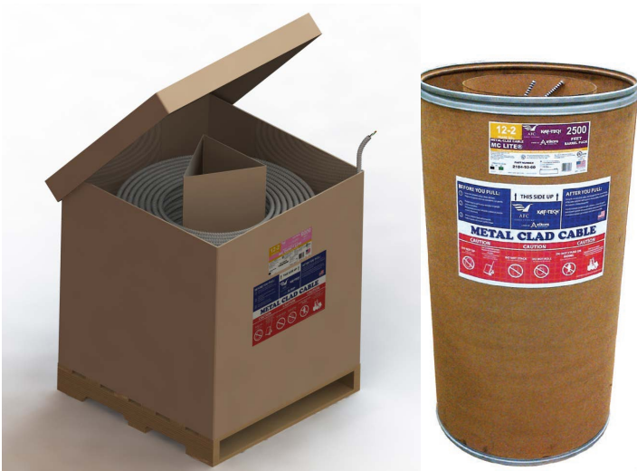
Barrel and Gaylord packaging options available upon request